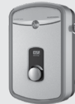
RTEX-08, RTEX-11, RTEX-13